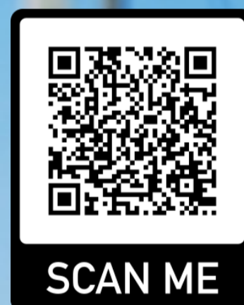
Senegal 2018